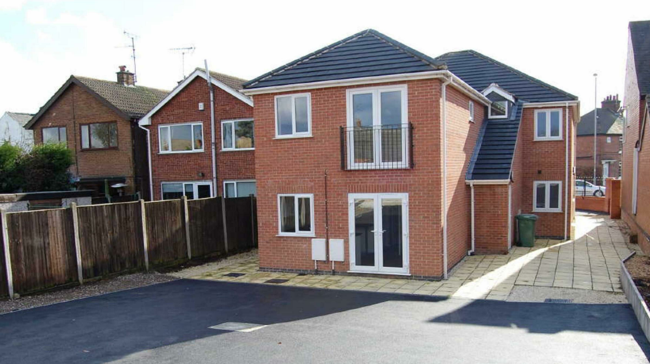
APARTMENT 3 MINSTER COURT, BOUGHTON, NOTTINGHAMSHIRE, NG22 9TA £55,000