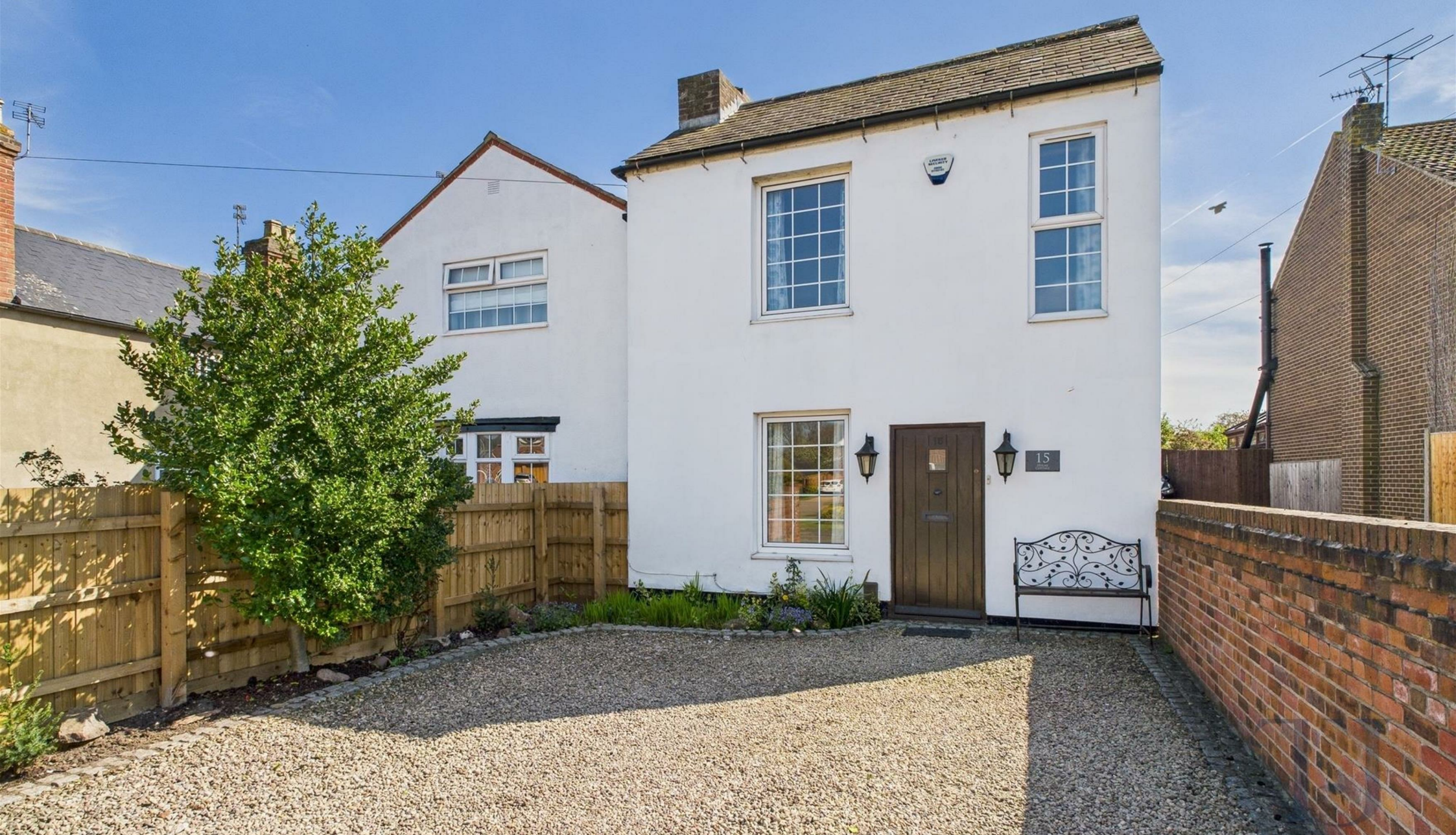
Holme Cottage, 15 Kegworth Road, Gotham, NG11 0JS