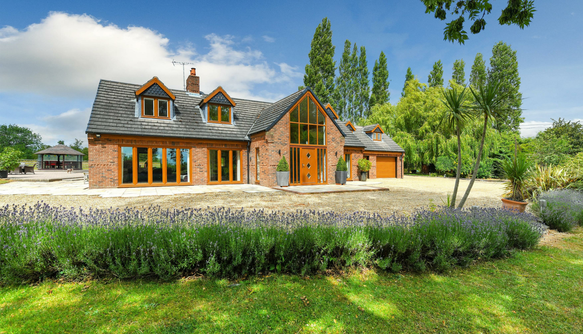
Ashley House, Ash Lane, Costock, LE12 6UX