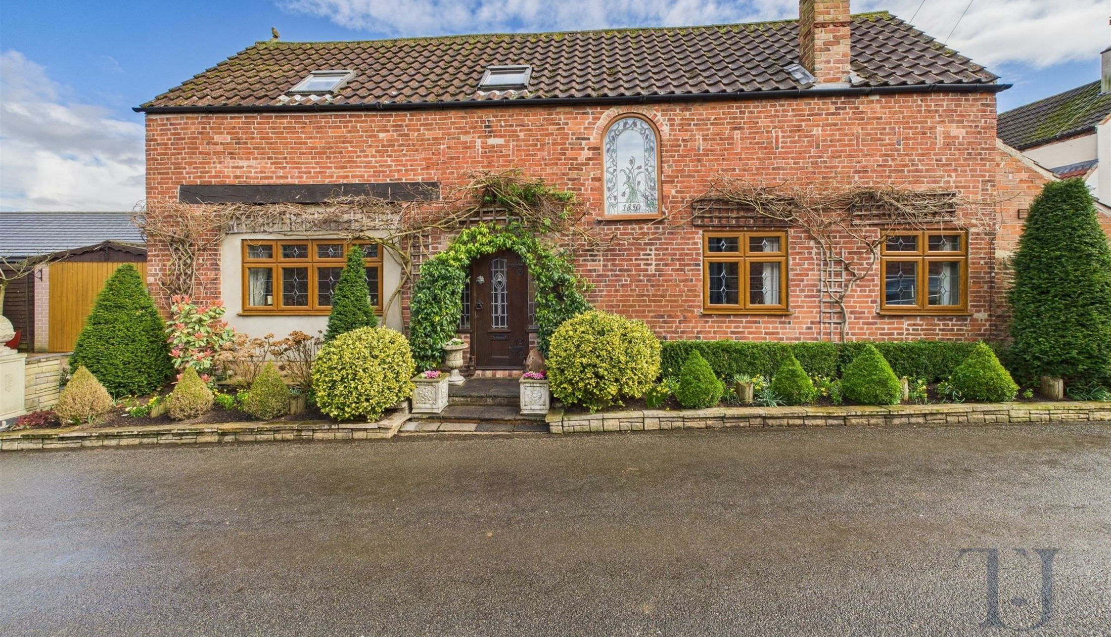
Old Garth Barn, The Rushes, Gotham, NG11 0HY