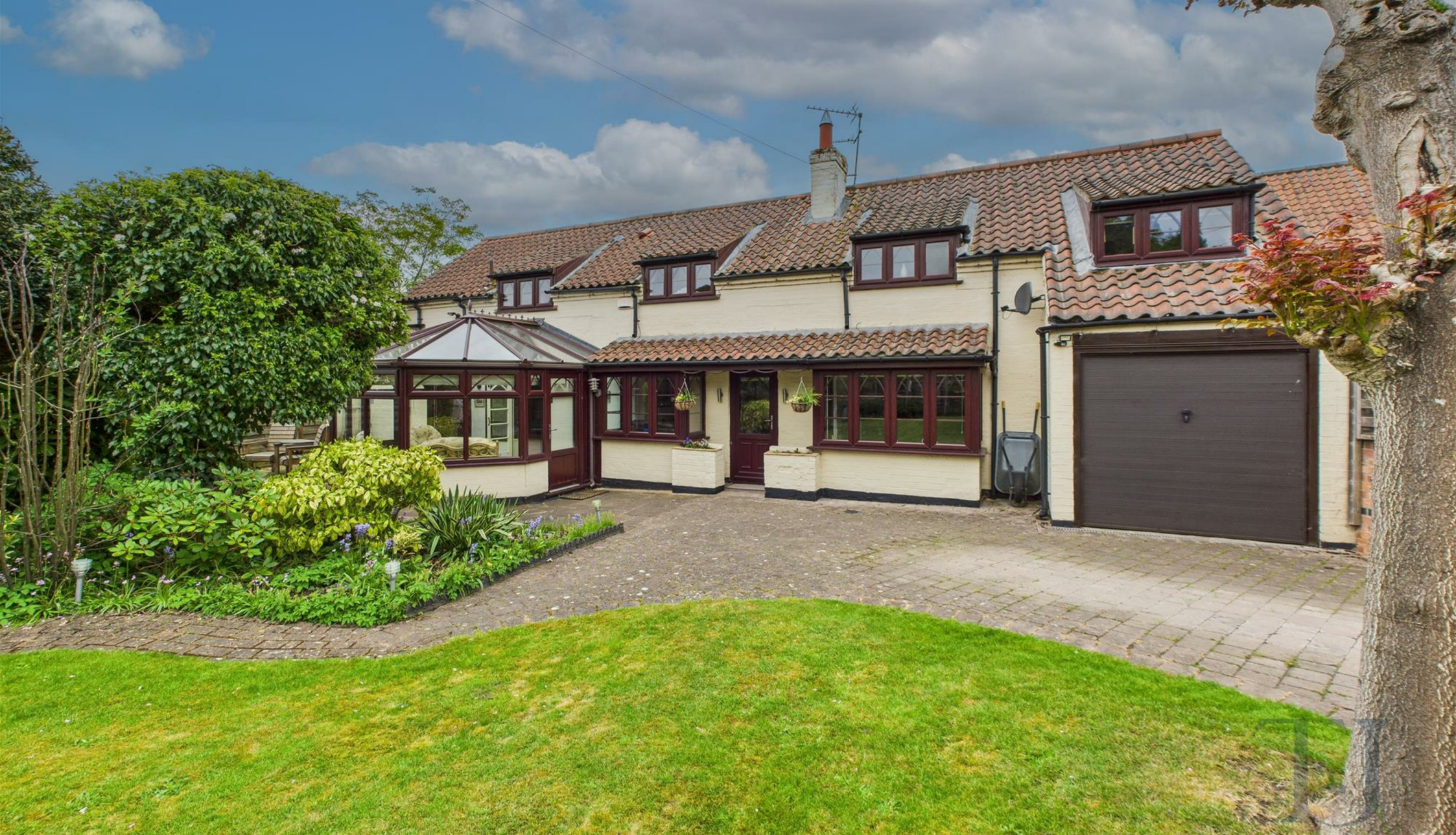
Court Cottage, Hardigate Road, Cropwell Butler, NG12 3AH