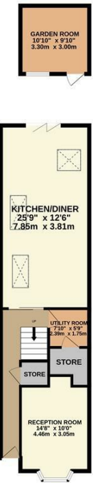
GROUND FLOOR 701 sq ft (65.1 sq m.) approx.