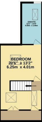
2ND FLOOR 487 sq ft (45.1 sq m.) approx.