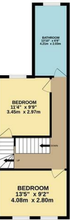
1ST FLOOR 450 sq ft (41.8 sq m.) approx.