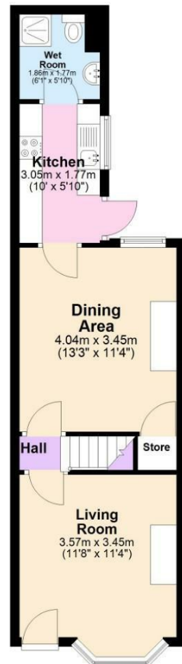
Ground Floor Approx. 38.8 sq. metres (417.4 sq. feet)