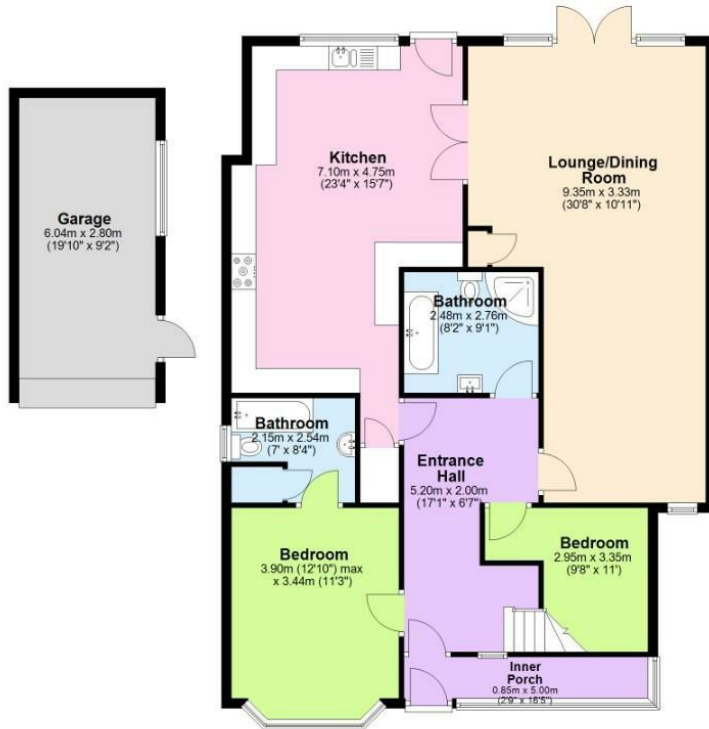
Ground Floor Approx. 152.6 sq. metres (1643.1 sq. feet)