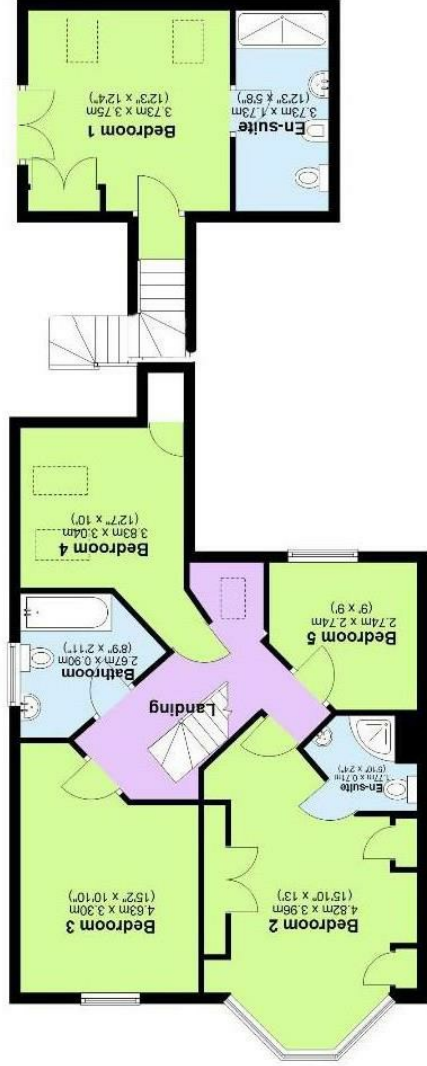
First Floor Approx. 90.2 sq. metres (971.2 sq. feet)

Total area: approx. 201.9 sq. metres (2172.7 sq. feet)