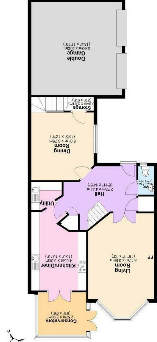
Ground Floor Approx. 111.5 sq. metres (1201.5 sq. feet)