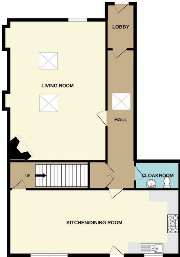
GROUND FLOOR 1071 sq.ft. (99.5 sq.m.) approx.