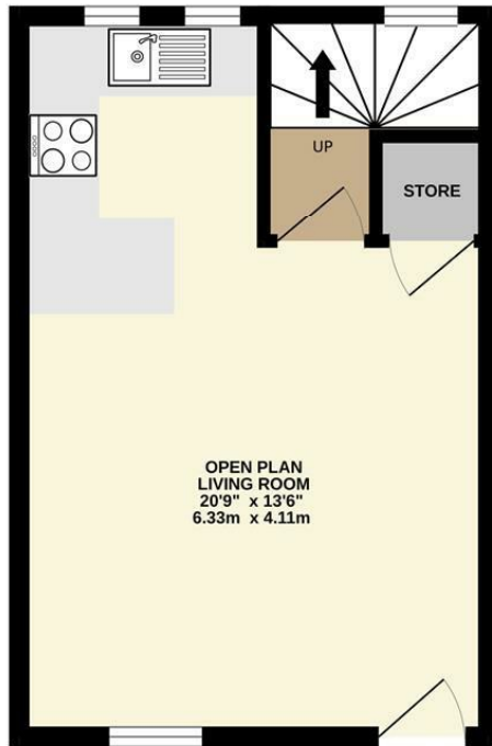
GROUND FLOOR 280 sq.ft. (26.0 sq.m.) approx.