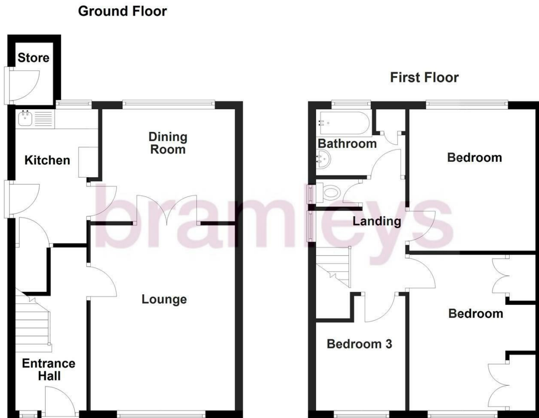
NOT TO SCALE AND NOT TO BE RELIED UPON Plan produced using PlanUp.