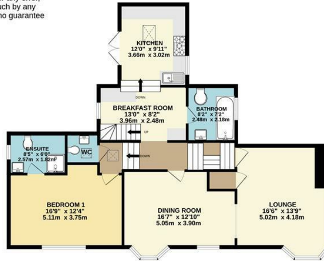
1ST FLOOR 1024 sq.ft. (95.1 sq.m.) approx.