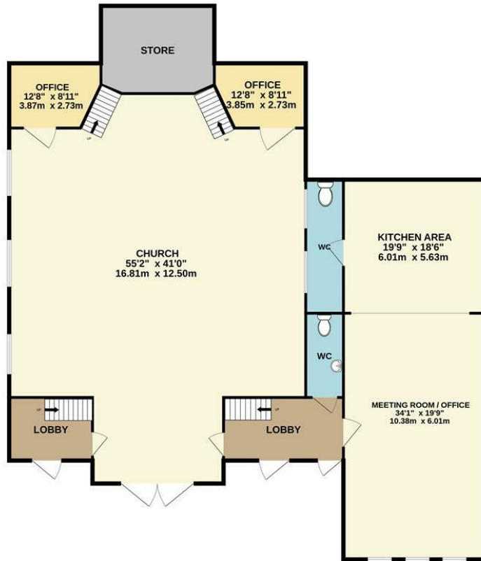
1ST FLOOR 3416 sq.ft. (317.4 sq.m.) approx.