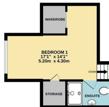
TOTAL FLOOR AREA : 1159 sq.ft. (107.7 sq.m.) approx.

Whilst every attempt has been made to ensure the accuracy of the floorplan contained here, measurements of doors, windows, rooms and any other items are approximate and no responsibility is taken for any error, omission or mis-statement. This plan is for illustrative purposes only and should be used as such by any prospective purchaser. The services, systems and appliances shown have not been tested and no guarantee as to their operability or efficiency can be given. Made with Metropix ©2023