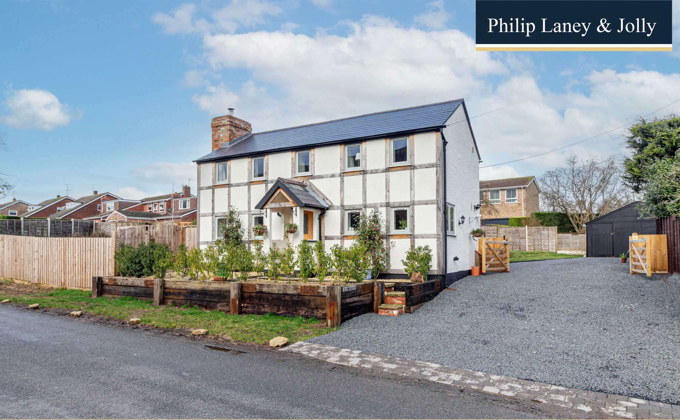
Swan Cottage , Worcester, WR6 5HY Guide Price £500,000