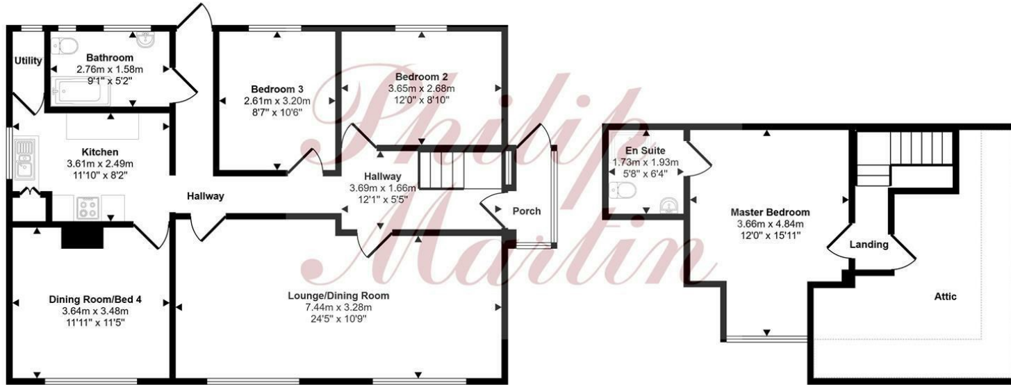
Ground Floor Approx 92 sq m / 994 sq ft