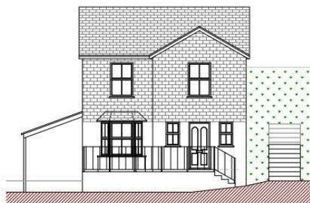
Proposed Front Elevation (North)