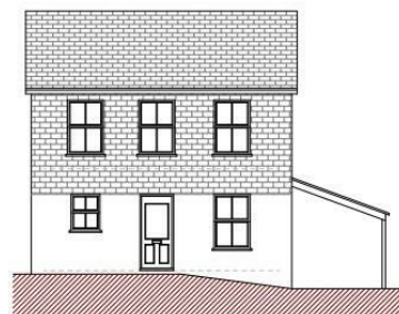
Proposed Rear Elevation (South)