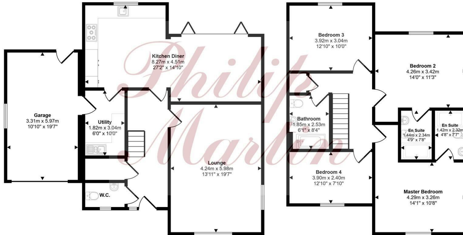
Ground Floor Approx 99 sq m / 1061 sq ft

Approx Gross Internal Area 176 sq m / 1894 sq ft