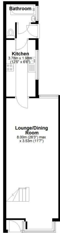
Ground Floor Approx. 42.2 sq. metres (453.9 sq. feet)