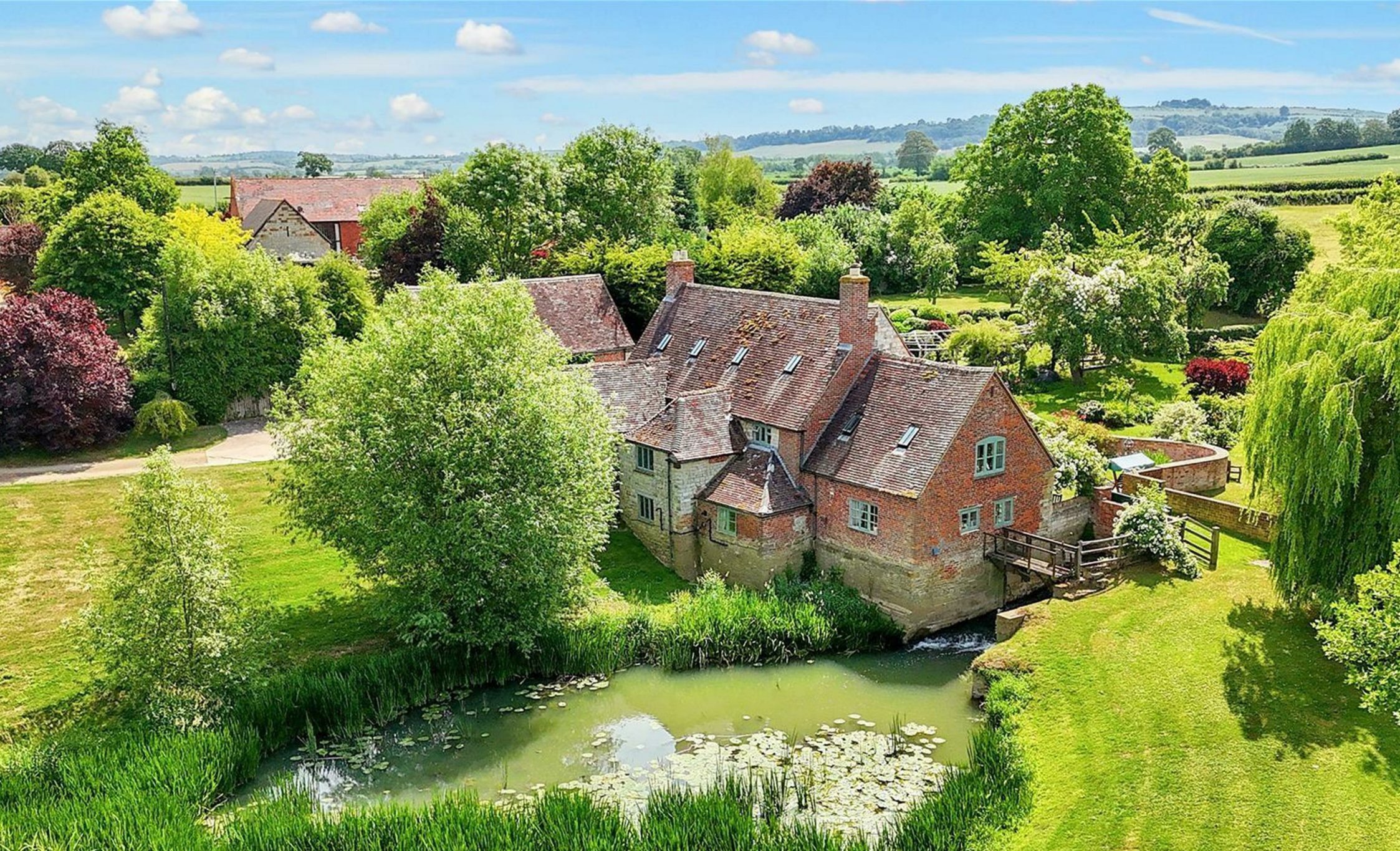
Fell Mill, Honington, Shipston on Stour, CV36 5AD