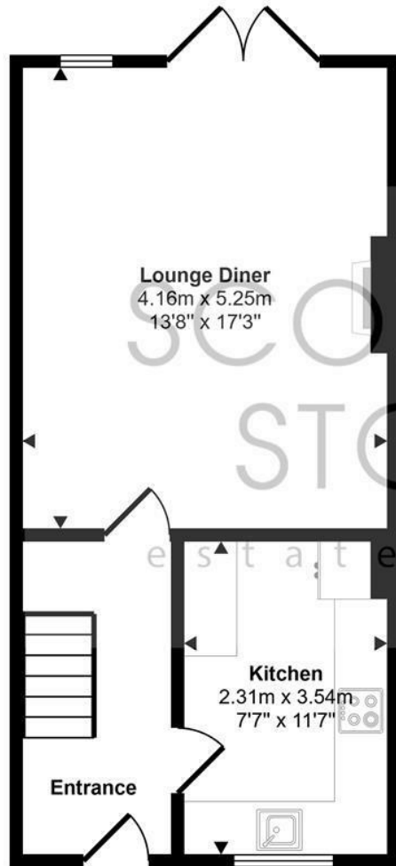
Ground Floor Approx 37 sq m / 401 sq ft

Approx Gross Internal Area 75 sq m / 805 sq ft