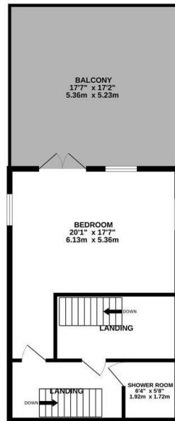
1ST FLOOR 464 sq.ft. (43.1 sq.m.) approx.