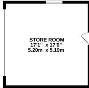
BASEMENT 290 sq.ft. (27.0 sq.m.) approx.