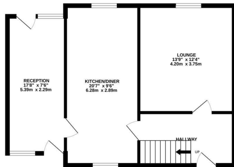
GROUND FLOOR 581 sq.ft. (54.0 sq.m.) approx.