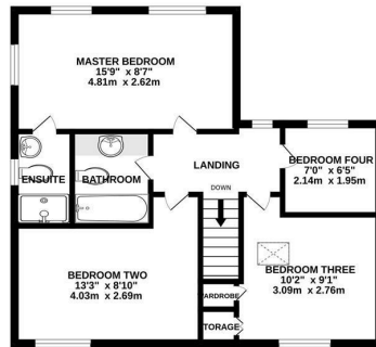
1ST FLOOR 531 sq.ft. (49.3 sq.m.) approx.