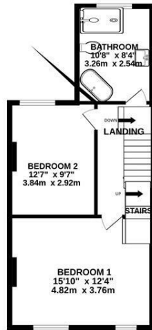
1ST FLOOR 480 sq.ft. (44.6 sq.m.) approx.