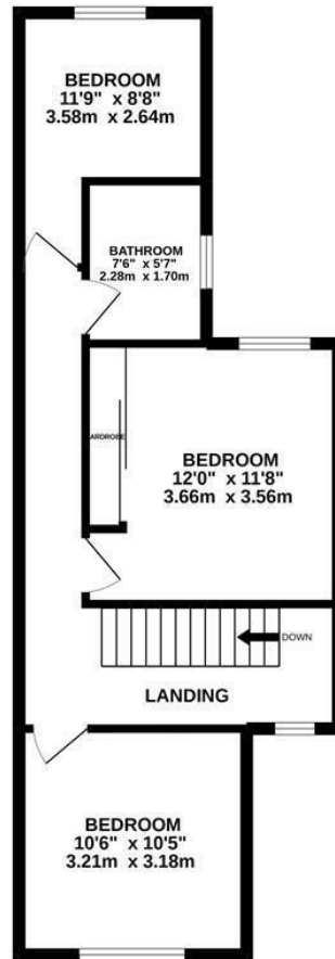
1ST FLOOR 504 sq.ft. (46.8 sq.m.) approx.