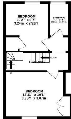
1ST FLOOR 345 sq.ft. (32.0 sq.m.) approx.