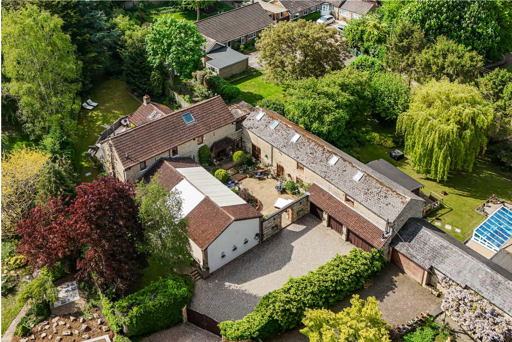
Glebe Barn, Cranford