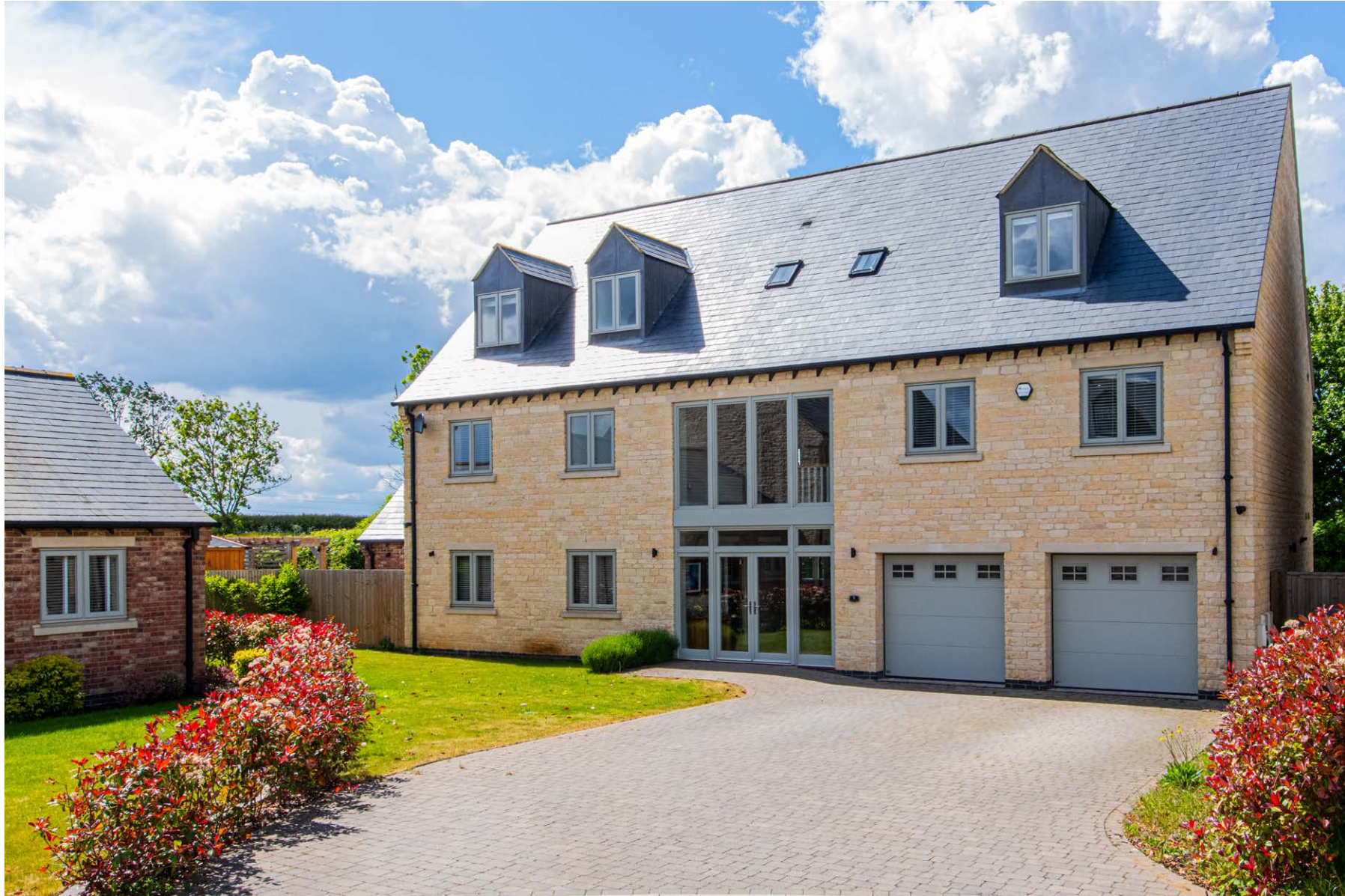
Coles Close, Little Harrowden