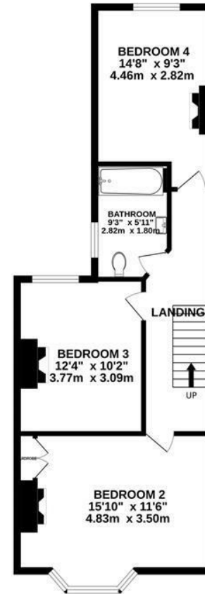
1ST FLOOR 568 sq.ft. (52.8 sq.m.) approx.