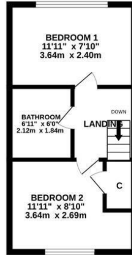
1ST FLOOR 282 sq.ft. (26.2 sq.m.) approx.