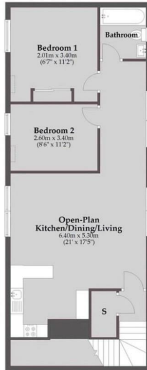
First Floor Approx. 62.0 sq. metres (667.6 sq. feet)