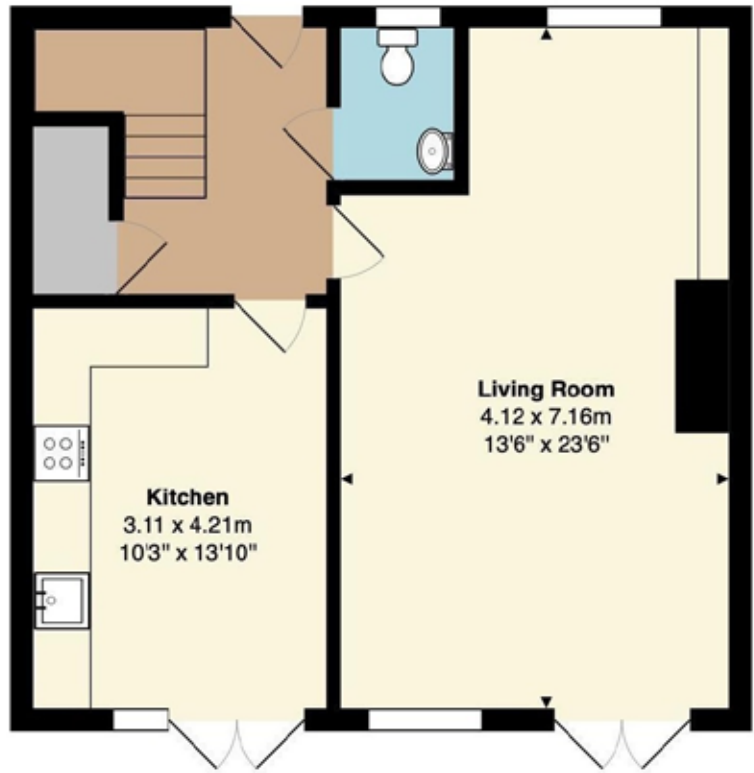
Ground Floor Area: 52.9 m 2 ... 570 ft 2