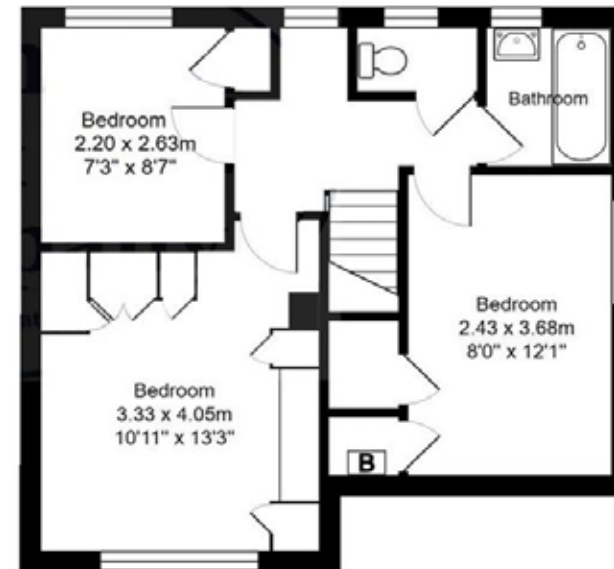
First Floor Area: 40.6 m 2 ... 436 ft 2