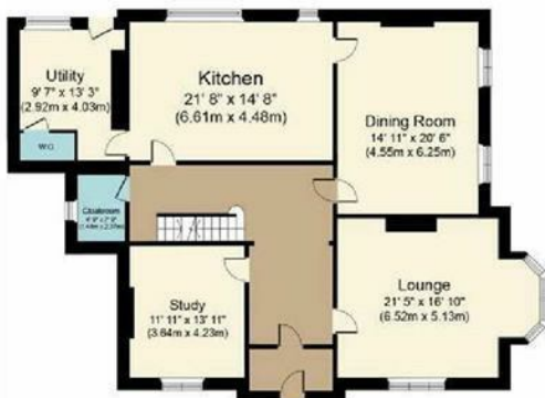
Ground Floor Approximate Floor Area 1,681 sq. ft. (156.2 sq. m.)