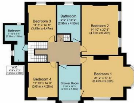
First Floor Approximate Floor Area 1,580 sq. ft. (146.8 sq. m.)