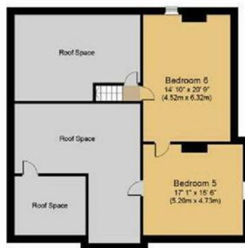
Second Floor Approximate Floor Area 1,437 sq. ft. (133.5 sq. m.)