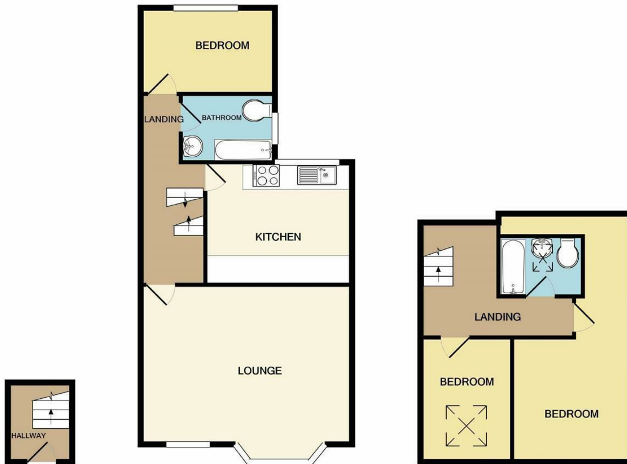
GROUND FLOOR APPROX. FLOOR AREA 34 SQ.FT. (3.2 SQ.M.)