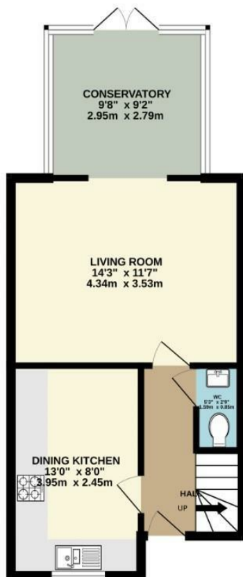
GROUND FLOOR 423 sq.ft. (39.3 sq.m.) approx.