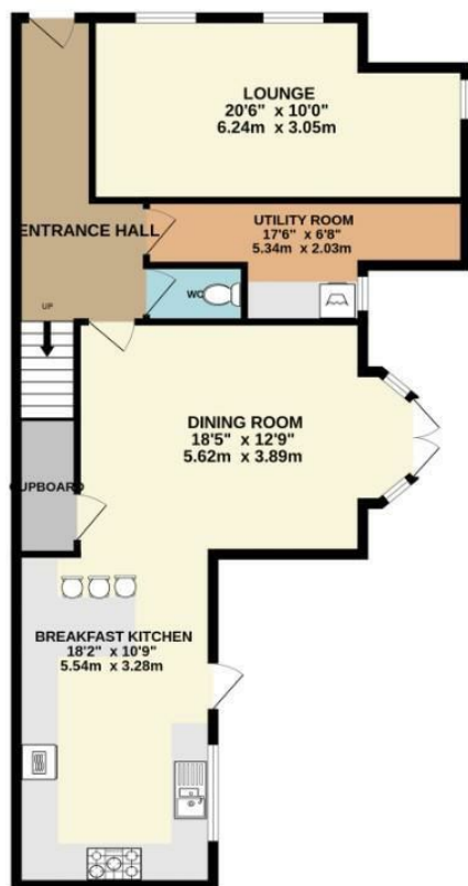
GROUND FLOOR 833 sq.ft. (77.4 sq.m.) approx.