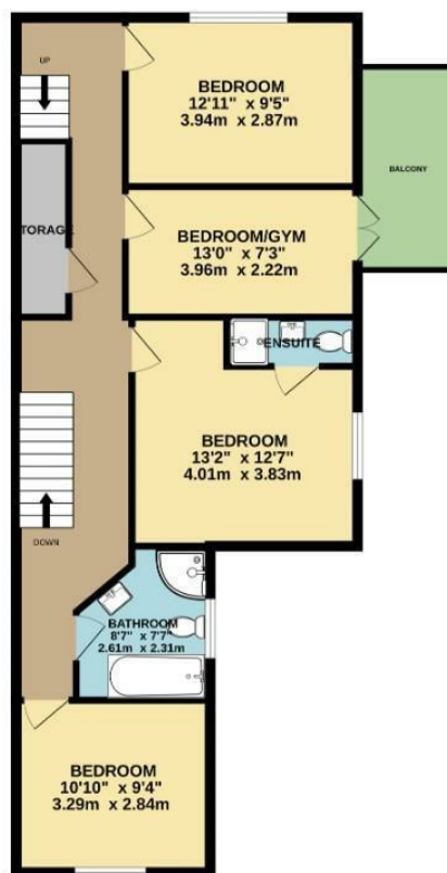
1ST FLOOR 755 sq.ft. (70.1 sq.m.) approx.