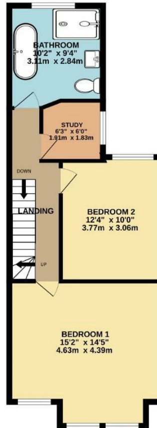
1ST FLOOR 451 sq.ft. (40.3 sq.m.) approx.