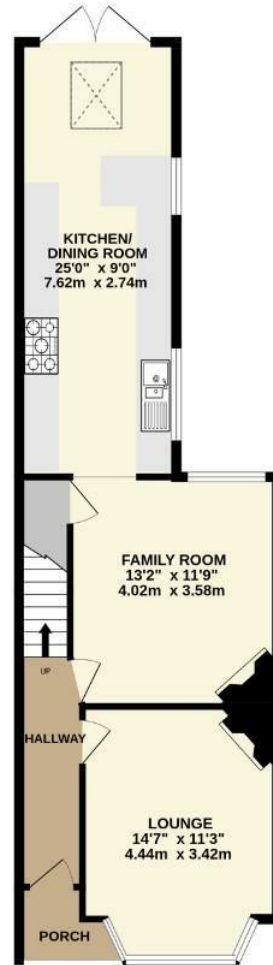
GROUND FLOOR 640 sq.ft. (59.5 sq.m.) approx.