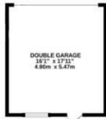
GROUND FLOOR 533 sq ft. (49.5 sq m.) approx.

These particulars whilst believed to be accurate set out as a general outline only for guidance and do not constitute any part of an offer or contract. Intending purchasers should not rely on these particulars of sale as a statement of representation of fact, but must satisfy themselves by inspection or otherwise as to their accuracy. No person in this agents employment has the authority to make or give any representation or warranty in respect to the property.