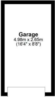
Ground Floor Approx. 72.6 sq. metres (781.8 sq. feet)

These particulars whilst believed to be accurate set out as a general outline only for guidance and do not constitute any part of an offer or contract. Intending purchasers should not rely on these particulars of sale as a statement of representation of fact, but must satisfy themselves by inspection or otherwise as to their accuracy. No person in this agents employment has the authority to make or give any representation or warranty in respect to the property.