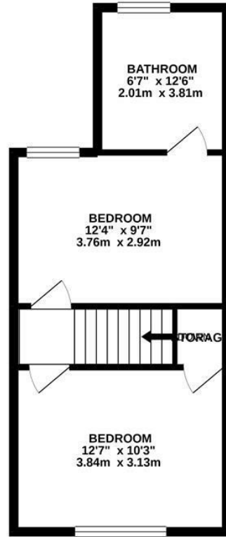
1ST FLOOR 388 sq.ft. (36.0 sq.m.) approx.