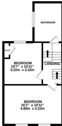
1ST FLOOR 446 sq.ft. (41.4 sq.m.) approx.