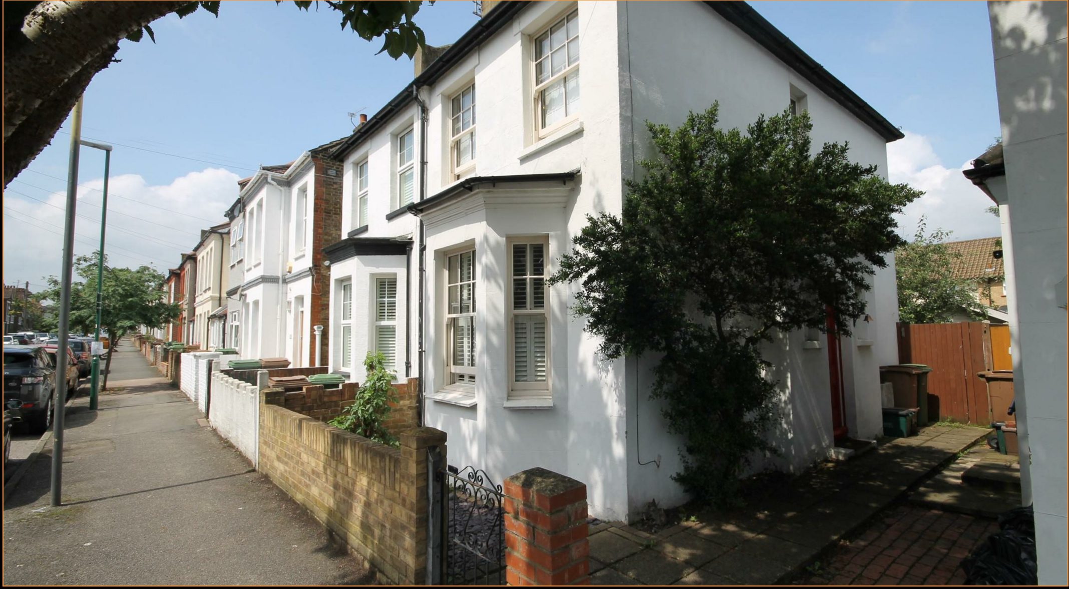
14 Beauchamp Road, Sutton, Surrey, SM1 2PZ