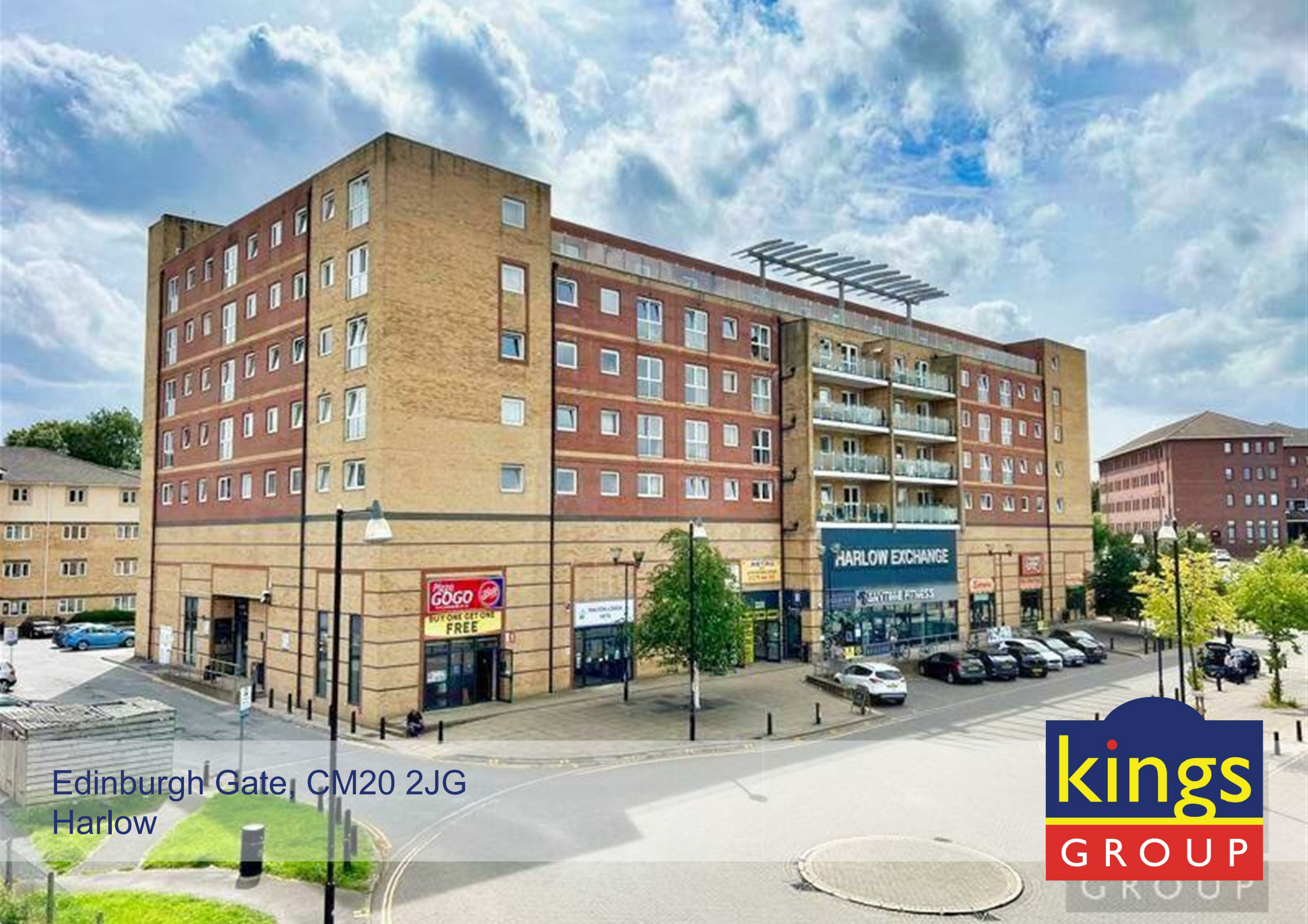
Edinburgh Gate, CM20 2JG Harlow