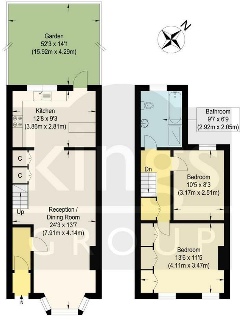
Ground Floor First Floor

Approximate Gross Internal Floor Area : 78.60 sq m / 846.04 sq ft Illustration for identification purposes only, measurements are approximate, not to scale.