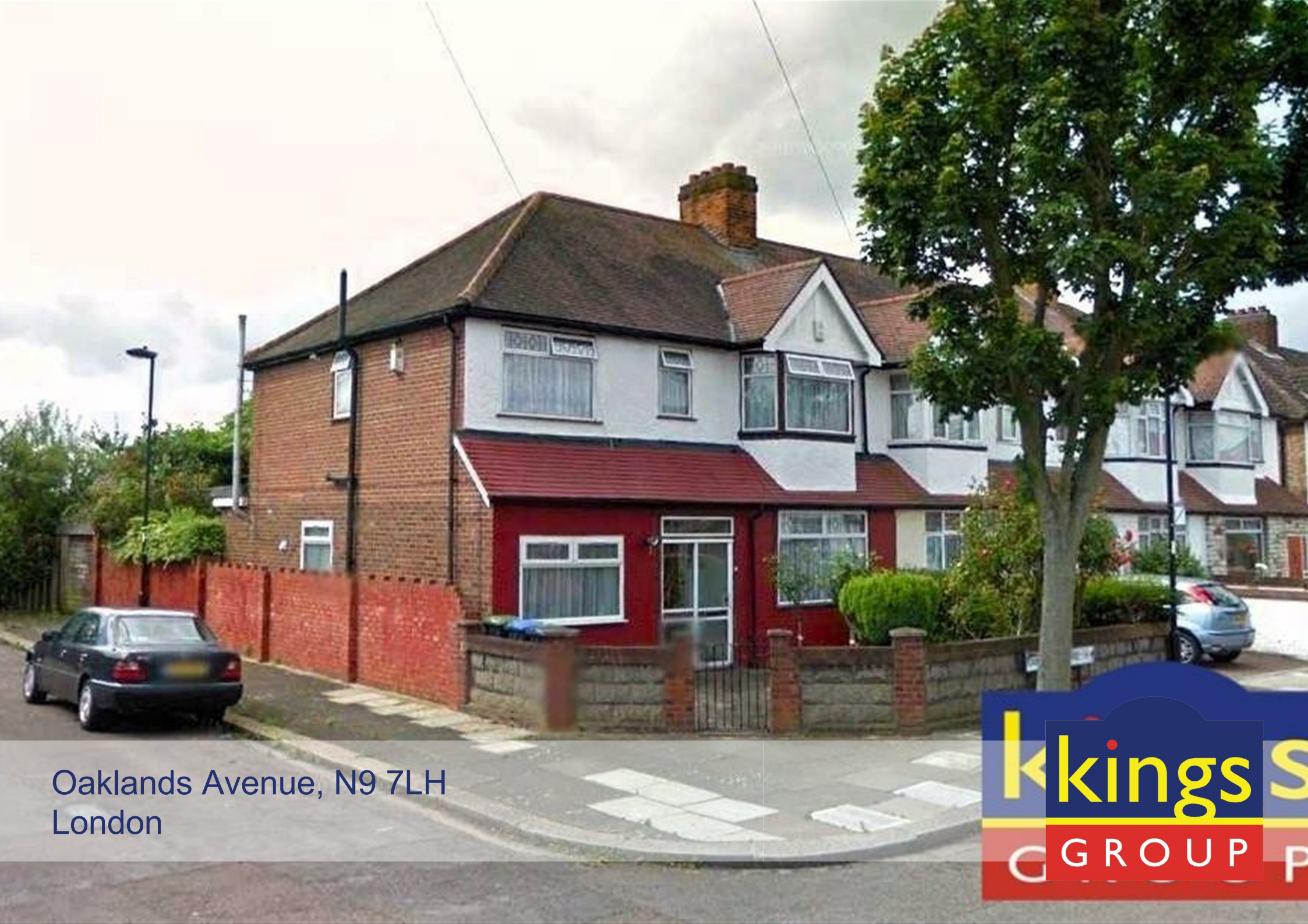
Oaklands Avenue, N9 7LH London